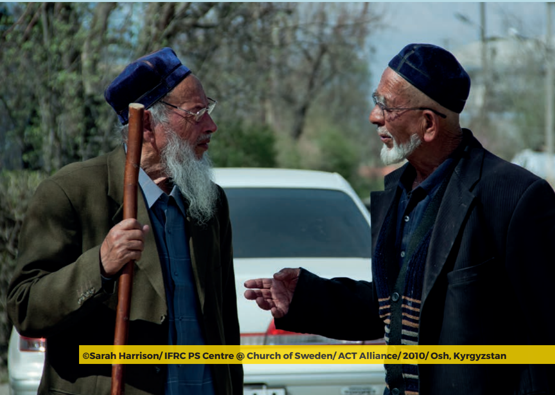
©Sarah Harrison/ IFRC PS Centre @ Church of Sweden/ ACT Alliance/ 2010/ Osh, Kyrgyzstan

During quarantine, where possible, safe communication channels should be provided to reduce loneliness and psychological isolation (e.g. WeChat).