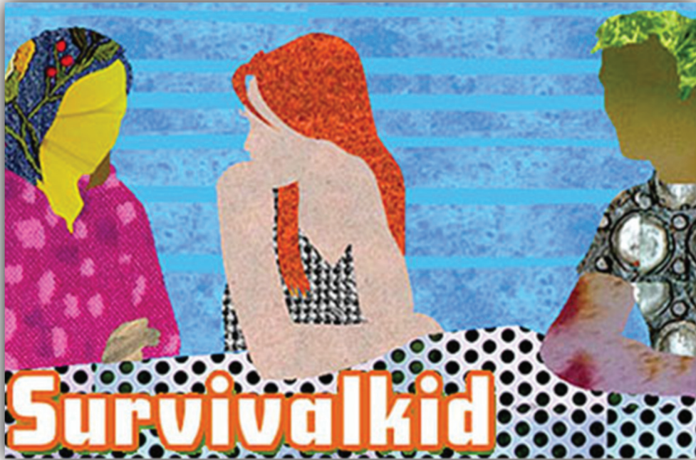
Figure 1. Silhouette images based on photographs.

kinds of mental disorders was changed into a series of short blocks of text, each with a distinctive header (e.g., “What does it mean?”; “How will it be cured?”), and real-life stories related to each block were adapted to the reading level of two different age groups (12-16 year olds and 16-24 year olds). A weekly survey was added that included such statements as, “If my mother feels depressed, I will not go out with my friends”. Visitors are encouraged to respond to the survey and to make comments in a forum about this and other features of the site. They may also start a new discussion or tell their own story.